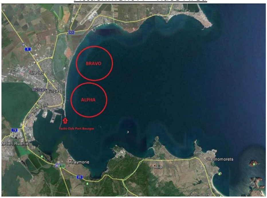
<u>Attachment A – Race Area</u>